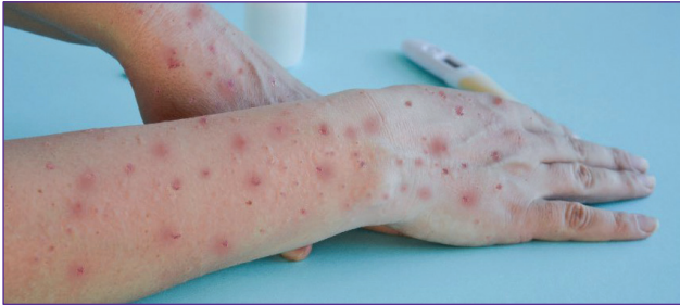
Figure 2. Within three days from the onset of the symptoms, a centrifugal maculopapular rash starts from the site of primary infection and rapidly spreads to other parts of the body. The lesions progress, usually within 12 days, simultaneously from the stage of macules to papules, vesicles, pustules, crusts and scabs before falling off.

Syndromic diagnosis represents a new alternative for detecting infectious diseases.